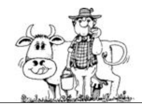
JUST BE PATIENT! In time, grass will turn into milk

Are you a patient or more an impatient person?